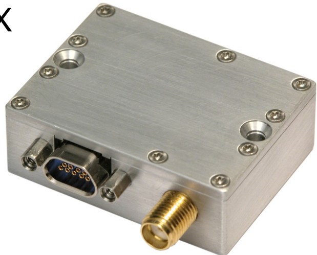
Dimensions 40mm x 30mm x 14mm